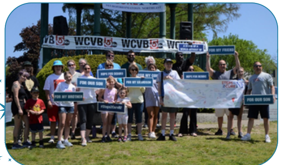
Lake Quannapowitt Wakefield, MA, Walk/Run