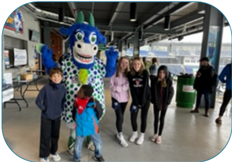
Dunkin Park ~ Hartford, CT, Walk