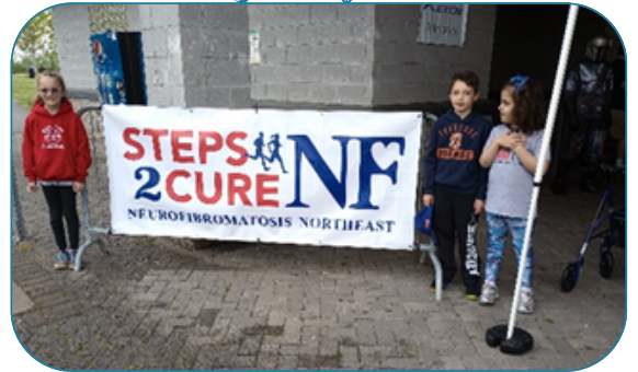
Overpeck Park ~ Ridgefield, NJ, Walk