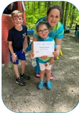
Forest Park Camden, NY, Walk