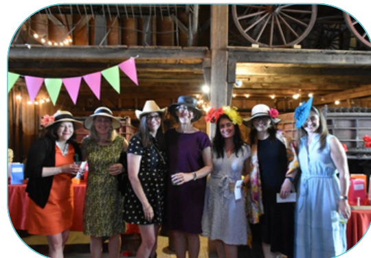
Friends enjoying the food, drink, and raffles at Hats, Horses, and Hope