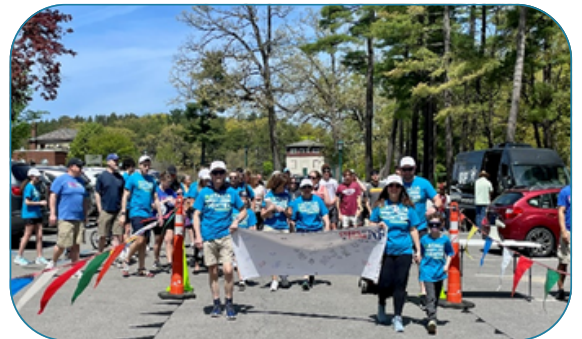
Central Park, Schenectady Capital District NY, Walk/Run

Special thanks to media sponsor Times Union for supporting our Schenectady Walk.