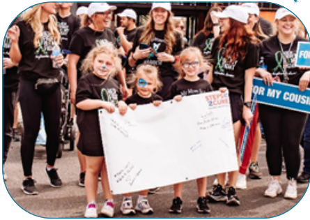
Riverworks ~ Buffalo, NY, Walk